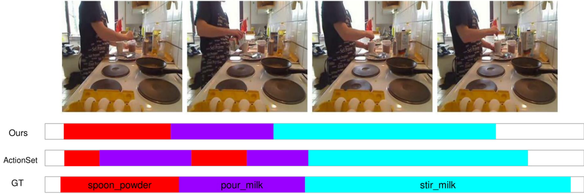
Figure 3. Comparing the segmentation quality of our method to the ActionSet method. Our method has predicted the right order of actions occurring in this video. Our approach also estimates the actions lengths better.